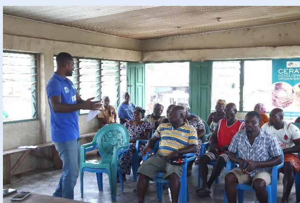
The event facilitator addressing participants during the session.

February also saw the project team organize a dialogue session with fisherfolk within the Elmina enclave of the Central Region. The interaction sought to elicit fisherfolk's genuine impressions of recent developments within the sector, their opinions on enhancing current fisheries management systems, and the strengthening of the union body for artisanal fisherfolk, the Ghana National Canoe Fishermen Council (GNCFC).