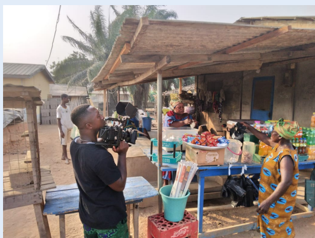
Video coverage at the Shama Apo community.

The footage was edited to birth the PTF project documentary. Below is the link to the documentary: https://www.youtube.com/watch?v=MI3AI5tufE4