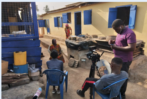
Video coverage of a project beneficiary at Mankwadze community

To help document, visualize, and disseminate the PTF project story, the project team engaged the services of a videographer to develop a documentary film on the project. The document sought to create a compelling narrative on the project's relevance, activities, results realized, and testimonials of beneficiaries. Additionally, the documentary was to provide lasting visibility for the project and the donor (European Union).