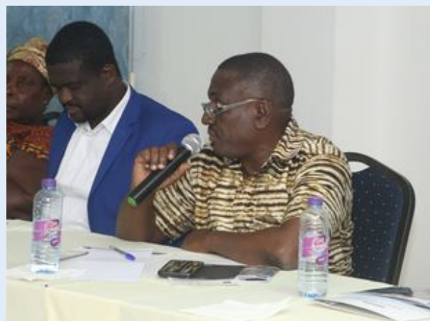
A participant giving his remarks about the achievements of the project.

The event was also an opportunity for the project team to share the results and successes of the intervention with stakeholders.