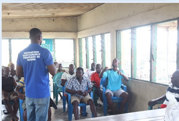
A participant sharing his views on prevailing issues within the sector.

February also saw the project team organize a dialogue session with fisherfolk within the Elmina enclave of the Central Region. The interaction sought to elicit fisherfolk's genuine impressions of recent developments within the sector, their opinions on enhancing current fisheries management systems, and the strengthening of the union body for artisanal fisherfolk, the Ghana National Canoe Fishermen Council (GNCFC).