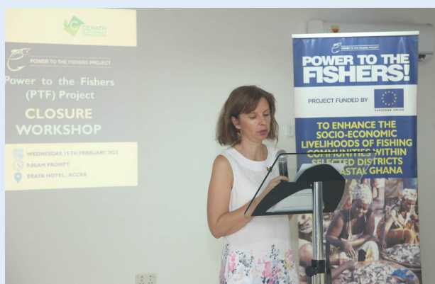
A representative of the EU Delegation giving her opening remarks.

A closure event was organized in February at the Erata Hotel, Accra, to sign off on the project. The event was to officially announce to stakeholders and collaborators the completion and closure of the 45-month PTF project.