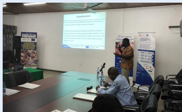
A PTF student researcher presenting his research findings.

The event, held on the University of Cape Coast (UCC) campus, had the theme “Development in Fisheries and Coastal Environments: A Focus on the PTF Project Thematic Areas”. The event was graced by participants drawn from the Fisheries Commission (FC), the European Union, the UCC faculty (including personnel of CCM), civil society, and fisher associations.