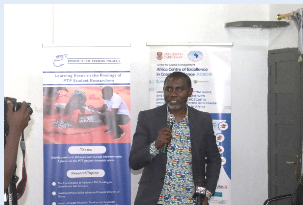
The EU representative giving an opening remark during the event

In February, the project, in collaboration with the Centre for Coastal Management (CCM), organized a learning event for the PTF student researchers to share key findings from their PTF-funded research efforts.