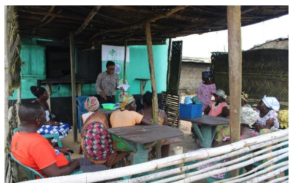
VSLA formation activities at Ekumpono.

The team has been able to facilitate the formation of 14 additional VSLAs, bringing the total count to 30, across the project communities. After a round of community entry sessions (on the VSL model), interested individuals were trained on the concept and assisted to constitute VSLAs.