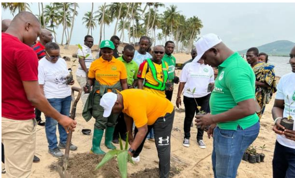
Commencement of Green Ghana Day in Winneba by the Paramount Chief of Effutu Traditional Area

The PTF team, on 10 June, joined the Forestry Commission in Winneba to commemorate the second edition of the Green Ghana Day (GGD). GGD is part of national efforts directed at mitigating the effects of climate change through a nationwide afforestation campaign.