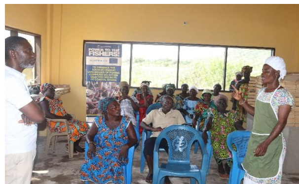
EU engagement with the learning group at Mankwadze

CERATH Development Organization is implementing the Power to the Fishers project with financial support from the European Union . The Power to the Fishers project is a four-year project to enhance the socio-economic livelihoods of fishing communities within selected districts of the coastal savannah zones of Ghana.