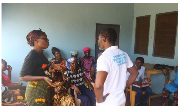
EU engagement with the Abotare VSLA at Mumford

The visit drew to a close with a debriefing on observations made. The EU shared with the team recommendations geared at enhancing project impacts and sustainability measures.