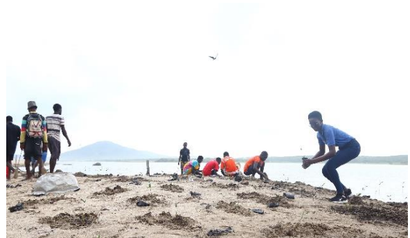
Planting of mangrove seedlings at MPRS

GGD ties in strongly with one of the PTF project's expected outcomes — enhancing coastal resilience to climate change