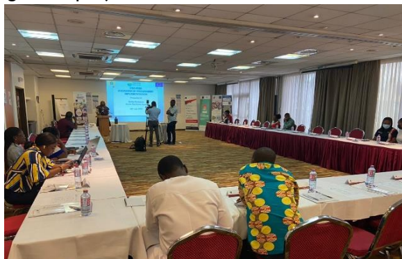
Cross section of participants at the event

In July 2022, the project team participated in a media engagement organised by the Technical Assistant Team (TAT). The event was targeted at creating further visibility for the CSO-RISE programme, the funding agency (EU), and the grantee projects.