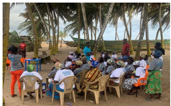
Interaction between EU and VSLA groups at Ekumpoano

November saw the EU pay a second verification visit to the PTF project sites. The week-long visit, among others, was to gain firsthand accounts of project impacts and interrogate the project's sustainability measures as the project grinds to a close.