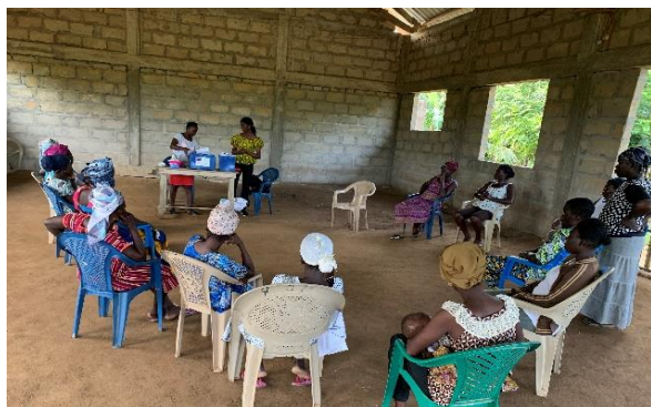
Monitoring of 'Onso Nyame Ye' VSLA at Fomaye