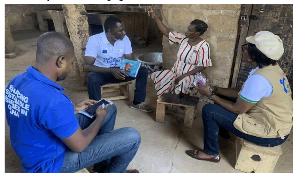
EU interaction with a stove host beneficiary at Abuesi

The visit had the EU make stops at several project communities to interact with some project-facilitated VSLAs, learning groups, and stove host beneficiaries. Additionally, some collaborating institutions supporting the project delivery were engaged.