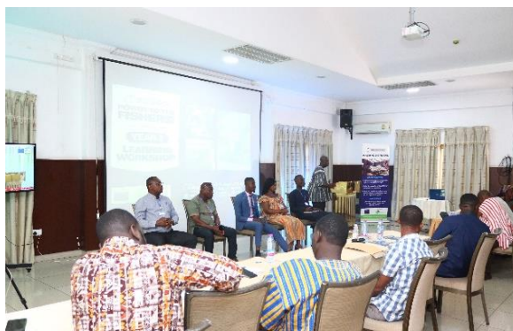
Panel discussion on premix fuel administration

as a pathway to financial inclusion, (ii) status of small pelagic fish stocks & Ghana Fisheries Recovery Activity's (GFRA) efforts at rebuilding, (iii) assessment of Ghana's closed fishing season implementation, and (iv) premix fuel administration & access.