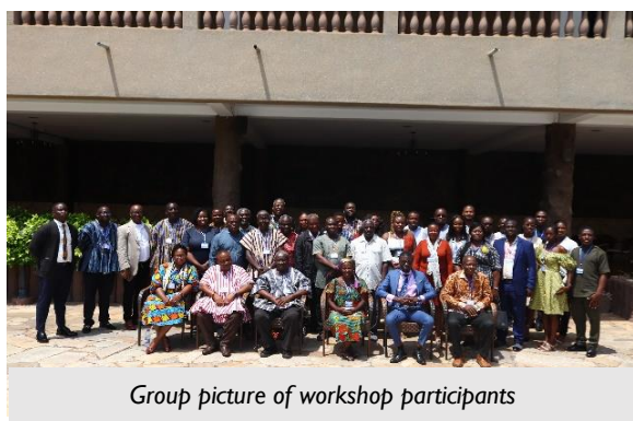
Group picture of workshop participants

The project team organized a fisheries stakeholder workshop in June at the Mensvick Hotel, Accra. The event was to provide key stakeholders an opportunity to deliberate on topical issues impacting the fisheries sector.