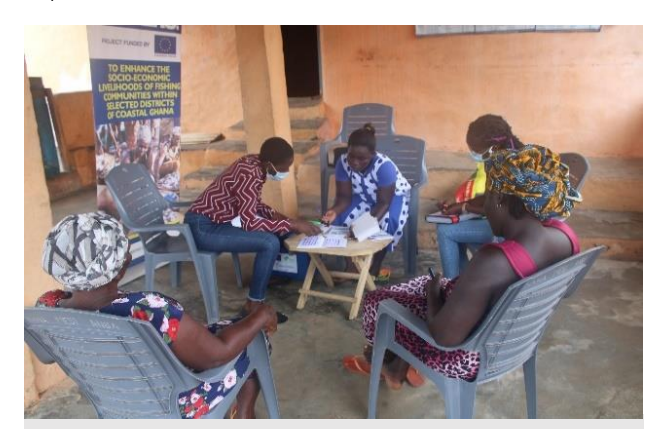
Collection of data on the 'Susuka' VSLA in the Otuam community

The team also undertook monitoring visits to observe the meeting procedures of the existing VSLAs. The monitoring visits were to provide feedback to the groups on modalities and compliance to the Village Savings & Loans (VSL) model. Additionally, the team visited the groups periodically to captured data on their financial performance. From this engagement, it was noted that an amount of Gh \not\in 264,685.00 had been raised by the groups and Gh \not\in 99,100.00 disbursed as loans to members.