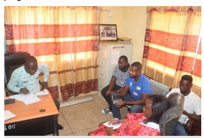
TAT and NAO representatives meeting with NHIA Gomoa District officer.

The Ministry of Finance is in partnership with the European Union (EU) to rollout the CSO-RISE programme. The TAT was contracted by MoF to support the implementation of the CSO-RISE programme.