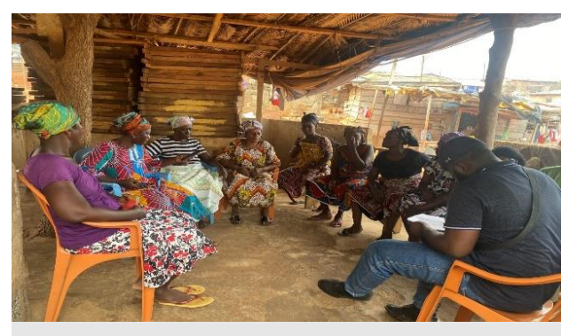
Focus group discussion at Mumford.

Subsequent to the reconnaissance visit (discussed in the <u>previous issue</u>) to the project communities, the 5 student researchers embarked on data collection for their respective research. The data collection was preceded by the receipt of ethical clearance from the Ethical Review Board (of the University of Cape Coast) and a pre-test.