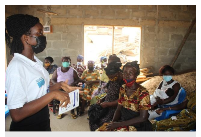
Commencement of Abotre VSLA new cycle

The reporting period witnessed the commencement of the second cycle of 15 VSLAs (2 of these had their share out in the previous reporting window).