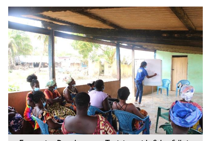
Enterprise Development Training with fisherfolk in the Aberekum Community

During this reporting period, the project team continued with sessions on enterprise development training (EDT) across the project communities.