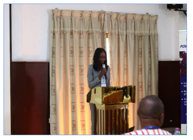
Annex C- Photo Gallery of Workshop Proceedings